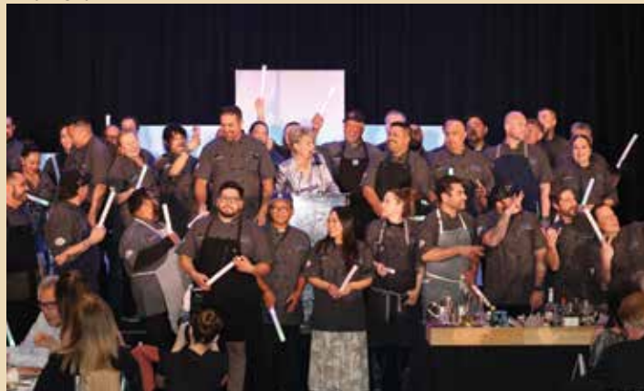
A powerhouse lineup of culinary talent lit up the stage at Top Chef Orange County 2025 as more than 50 chefs were honored