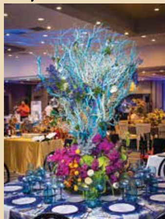
A visual feast in every sense - under-the-sea inspired tablescape