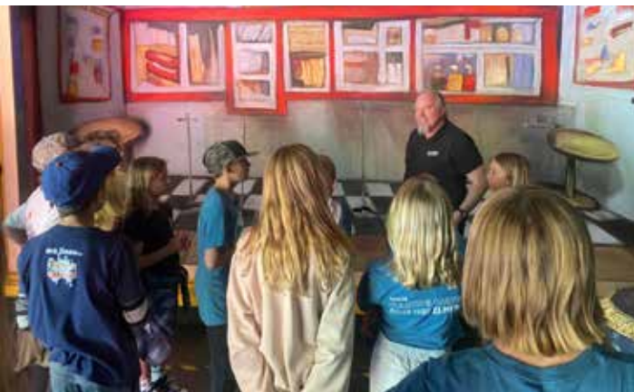
Pageant of the Masters staff give a tour to students from Laguna Beach